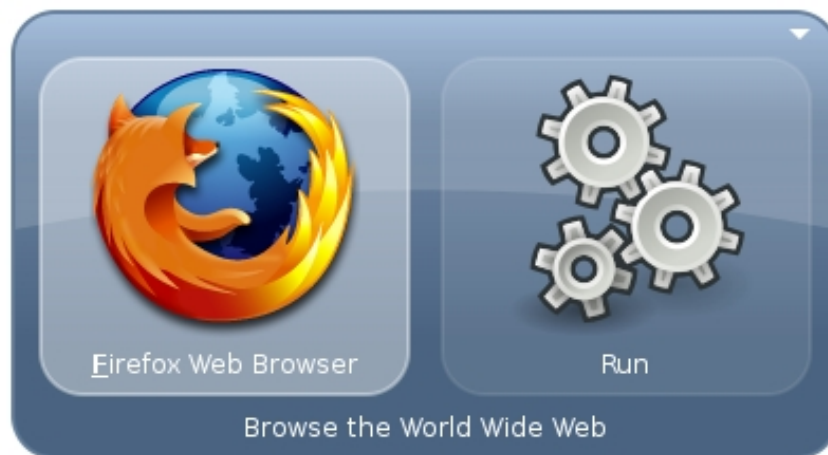
Figure 2: GNOME Do's "Classic" interface

Quicksilver has an extensive configuration interface through which the user can customize the behavior of the application. For example, one can benefit greatly from configuring Quicksilver to index the contents of one's Documents folder. This is done by opening the Quicksilver preferences window, navigating to the "Catalog" configuration section, then navigating to a subsection of that section, and clicking on a small button on the bottom edge of the window. This button reveals a menu containing the option to add a "File & Folder Scanner," which allows the user to navigate to her Documents folder in another window and finally choose