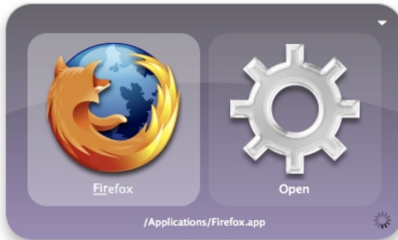
Figure 1: Quicksilver's "Bezel" interface